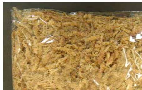
Fig. 5. Commercially available peatmosses from a local nursery.

Peatmosses are commercially harvested and are used by florists and nurseries for their water retaining properties. Sphagnum mosses for this lab exercise may be purchased at your local florist, nursery, or online through Carolina Biological Supply .