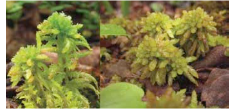
Fig. 1. Sphagnum . The plants are upright, and the upper branches are clustered into compact heads.

The genus Sphagnum (common name peatmoss) comprises many species, which are typically recognized and rather easily distinguished from other mosses by their upright stem with a dense cluster of tightly packed terminal branches forming like a head (also named capitulum ; Fig. 1 ). Below the capitulum, the branches are more widely spaced, given the plant a feathery appearance ( Fig. 2 ).