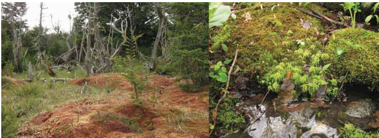
Fig. 4. Peatmosses grow in wet habitats, typically with little water flow. At high latitudes in both hemispheres they form extensive peatlands, dominating the vegetation (left; Patagonia). Such Sphagnum dominated vegetation may also occur at high altitudes in tropical latitudes. In more temperate zones, Sphagnum may occur along brooks (right; New England forest).

Peatmosses are found in wetlands or along brooks in forests ( Fig. 4 ). The moss is often found in “stands” of many individuals forming soft cushions or more often mats. They can easily be collected by gently pulling the plants out of the soft substrate of the wetland that they inhabit. Be sure to ask landowners for permission before collecting plants. Collection permits are necessary to collect plants on state or federal lands.