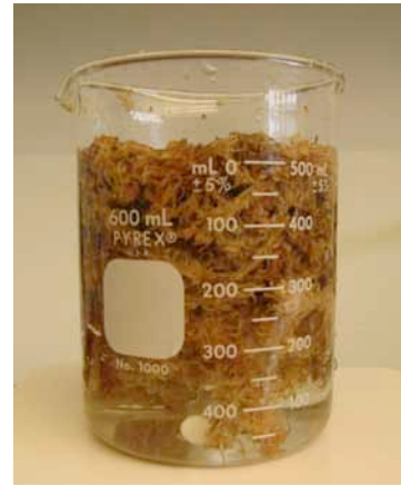
Fig. 6. Commercially available peatmosses in a laboratory beaker in water.